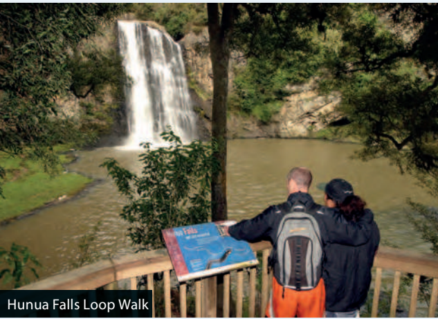
Hunua Falls Loop Walk