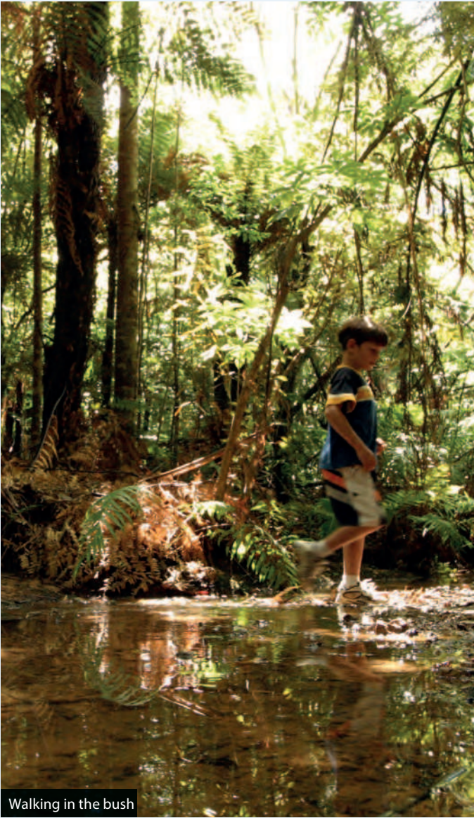
Walking in the bush