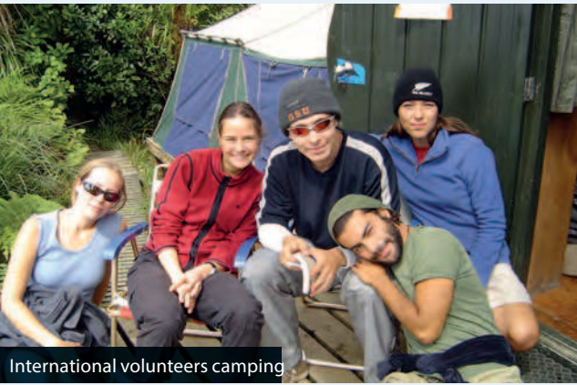
International volunteers camping