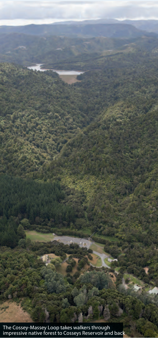
The Cossey-Massey Loop takes walkers through impressive native forest to Cosseys Reservoir and back

The loop combines the Suspension Bridge Track with part of the Wairoa Cossey Track. Start at the suspension bridge over the Wairoa Stream, near the car park on the Wairoa Reservoir Access Road (off Moumoukai Road). The walk takes you through lush vegetation, climbing to a spectacular lookout platform above the Wairoa Reservoir. Continue on the track to the junction with Wairoa Cossey Track. Turn right at the junction and follow the track back down to the road.